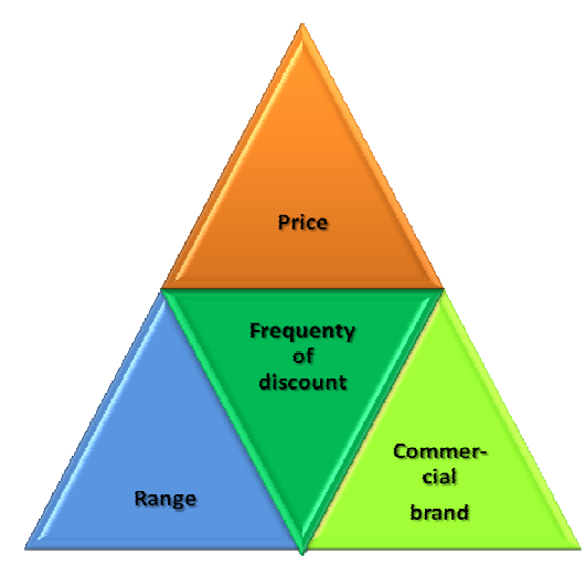
Pyramid of discount stores

By the fourth channel of distribution – by the little stores which do members of different networks - the costumers prefer the scale of commercial brands better than the range of scale of all products, which are available in these stores. The rage of scale is much smaller than in the other three kind of channel of distribution, it can be explained by the small floor space. The price of commercial and producer brands are rated into third rank by this pyramid. The discounts and sales and its' measure is smaller, than in the other three channels of distribution.