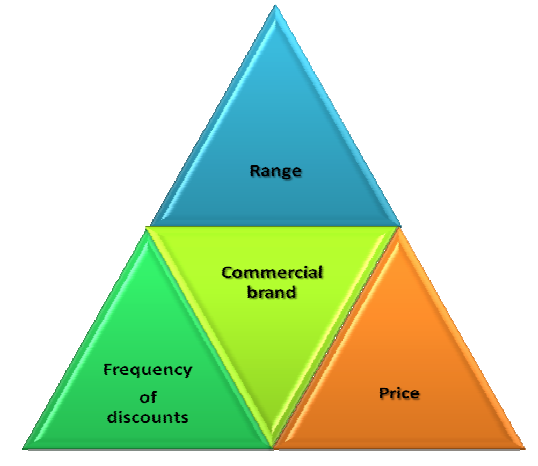
Pyramid of hypermarkets

Based on the answers of the responders by the hypermarkets the peak of the pyramid is the range, because the costumers find the biggest range of scales in this type of stores. There are a huge range of different brands and commercial brands. Next to the commercial brand the costumers find producer brands also. Because of this the hypermarkets are able to satisfy the costumers that are price-sensitive or qualitysensitive. The costumers pointed the frequency of discounts as the third important element and the price as the fourth element of the pyramid of hypermarkets.