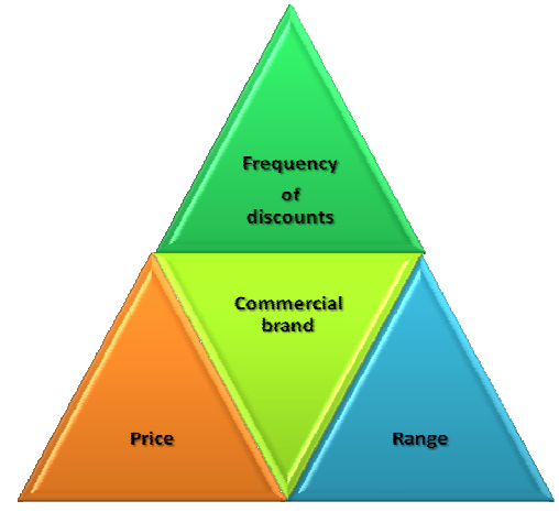
Pyramid of supermarkets

Based on the answers of the responders, the peak of the supermarkets' pyramid is the frequency of discounts . The second element which influence the selection of the stores are the products which are commercial brand ed. The third element is the price. The price got a better judgment than the range of scales other producer brands.