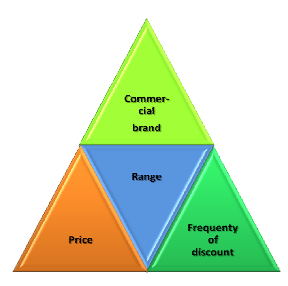
Pyramid of the little stores which are members of different networks